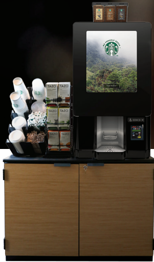
Serenade™ single-cup brewer featuring Seattle's Best Coffee® also available